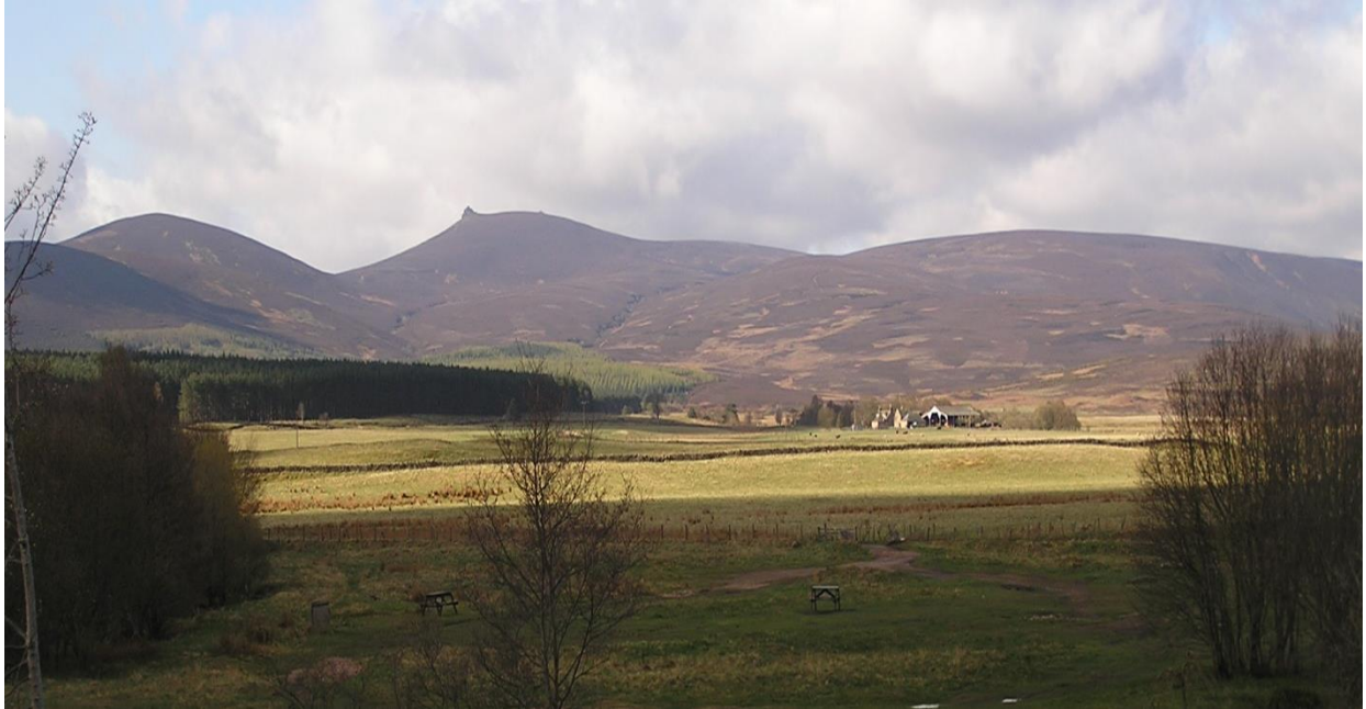
VIEW OF CLACHNABEN FROM THE FEUGHSIDE GUESTHOUSE