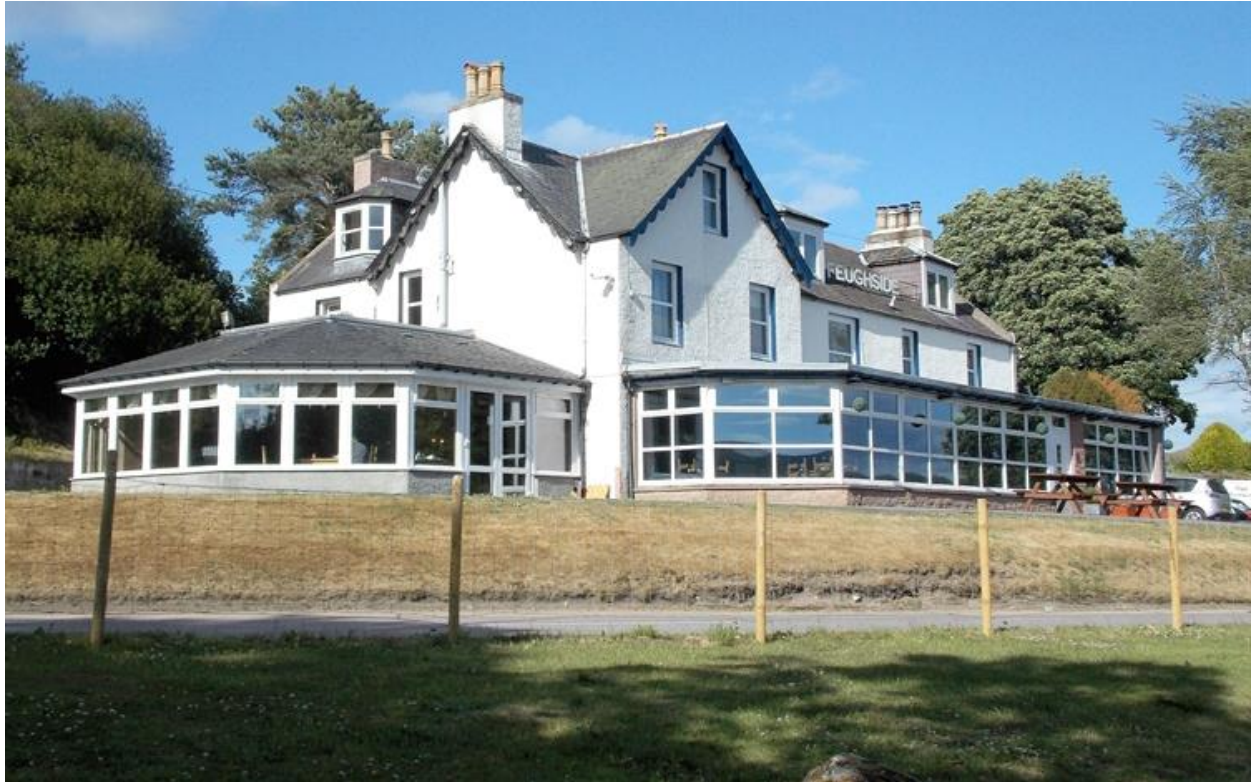
THE FEUGHSIDE GUESTHOUSE HOME OF CLAN STRACHAN