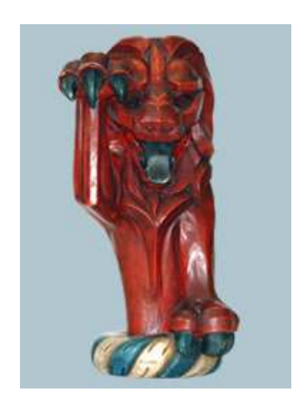
<u>home</u> | <u>printer friendly</u> | <u>top</u> | <u>back</u>